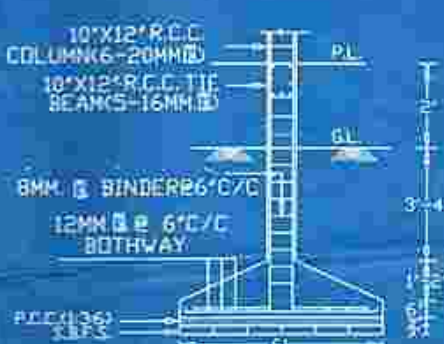
R.C.C. COLUMN DETAILS SCALE-1"=4'-0"