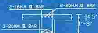
END SECTION OF BEAM SCALE-1"=2'-0"