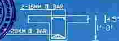
MIDDLE SECTION OF BEAM SCALE-1"=2'-0"