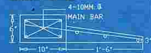
LINTEL DETAIL SCALE-1"=1'-0"