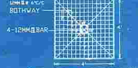
R.C.C. COLUMN FOOTING (VER) SCALE-1"=4'-0"