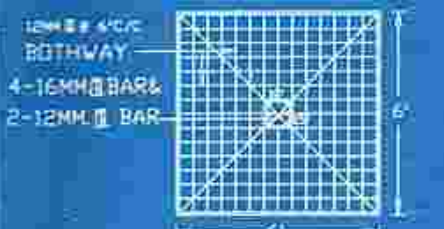
R.C.C. COLUMN FOOTING SCALE-1"=4'-0"