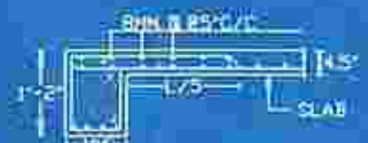
R.C.C. ROOF SECTION WITH WALL BEAM SCALE-1"=2'-0"