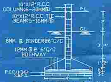
R.C.C. COLUMN DETAILS SCALE-1"=4'-0"